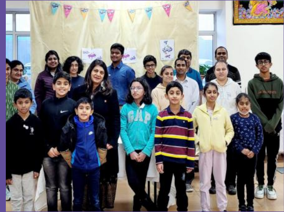
Cardiff Bhumi Shakha