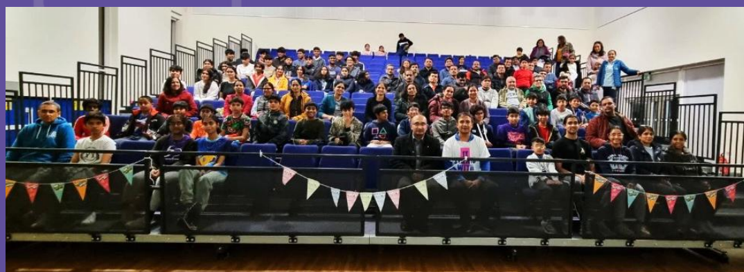
Manchester Surya Shakha