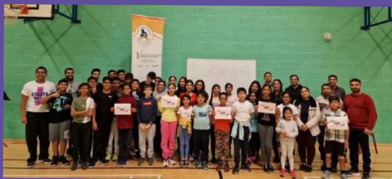
Bushy Pandav Shakha