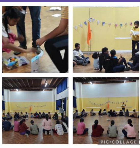
Bromley Sanskar Shakha