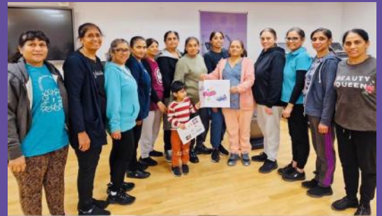
Woolwich Pannabai Shakha