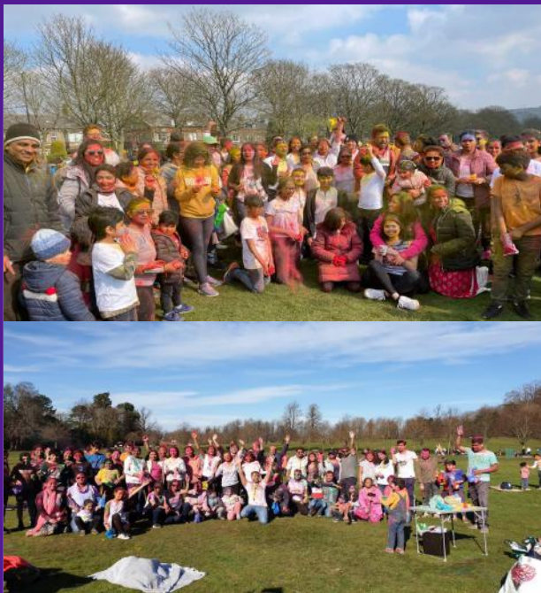
Newton Mearns Glasgow & Halifax