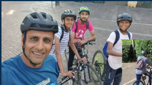
Cycle4Sewa participants from Reading