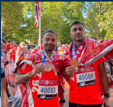
Running the London Marathon for Sewa UK