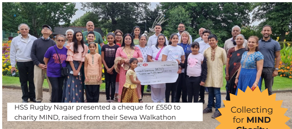
HSS Rugby Nagar presented a cheque for £550 to charity MIND, raised from their Sewa Walkathon