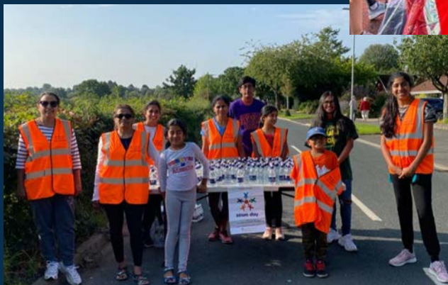
Manchester Volunteers manning one of the Altrincham 10k Run waterpoint